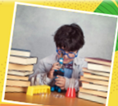
STEM Literacy for Grades 1-3