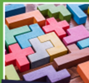
Puzzles and Pi for Grades 5-11