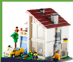
LEGO City for Grades 2-4