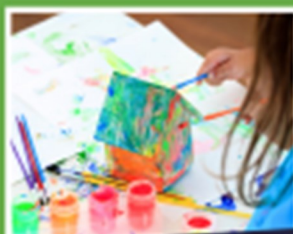
Arts and Crafts for Grades PreK-1