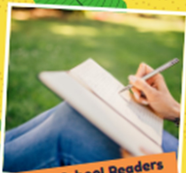
Middle School Readers and Writers for Grades 3-4 and 5-7