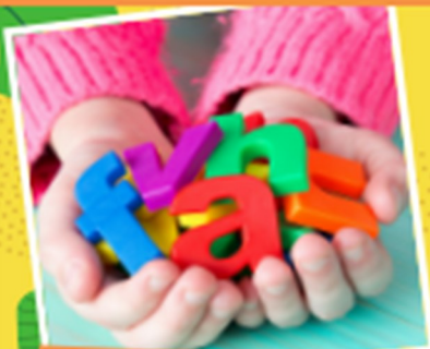
Kinder Connect for Pre-K