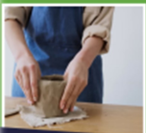
Ceramics for Grades 4-9