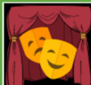
Theatre for Grades 5-7