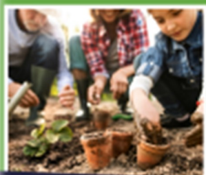
Gardening for Grades PreK-1