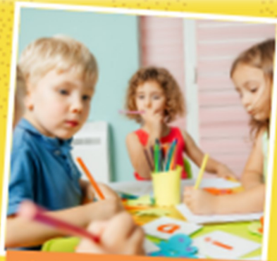
First Grade Fundamentals for Kindergarteners