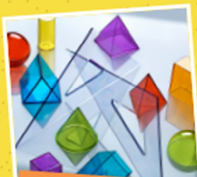
Math Mindset for Grades 5-7