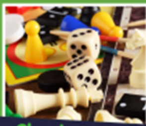
Classic Games for Grades 1-3